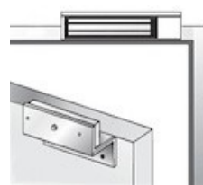
Montagem suporte Z