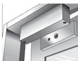
Montagem sem suporte