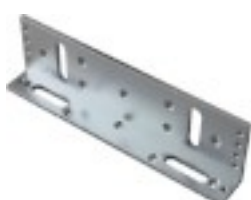
MEM500PL 266 x 38 x 76 mm