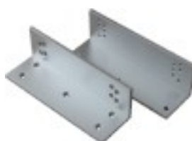
MEM500PZ 185 x 60 x 60 mm 185 x 60 x 60 mm