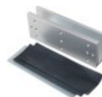
MEM500PU 180 x 38 x 70 mm vidro 13 a 20 mm