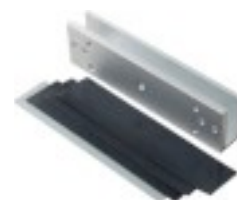
MEM300PU 180 x 28 x 46 mm vidro 8 a 15 mm