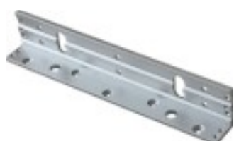
MEM180PL1 207 x 26 x 39 mm