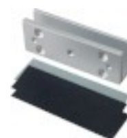
MEM180PU 130 x 28 x 46 mm vidro 8 a 15 mm