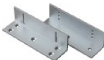
MEM180PZ 130 x 37 x 38 mm 130 x 38 x 38 mm