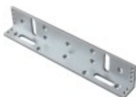
MEM300PL 250 x 30 x 47 mm