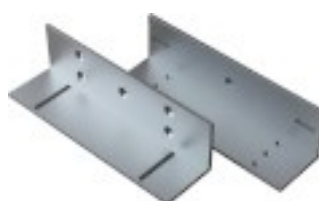
MEM300PZ 180 x 49 x 50 mm 180 x 49 x 50 mm