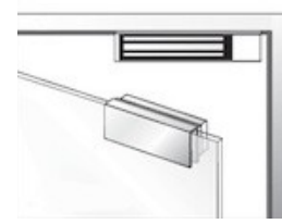
Montagem suporte U